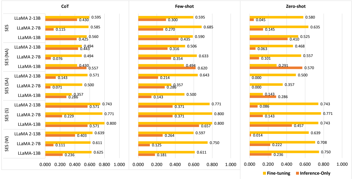
Figure 3: Per-relation performances of fine-tuned and inference-only LLaMA and LLaMA 2 families. NA: Necessary Assumption . SA: Sufficient Assumption . S: Strengthen . W: Weaken .